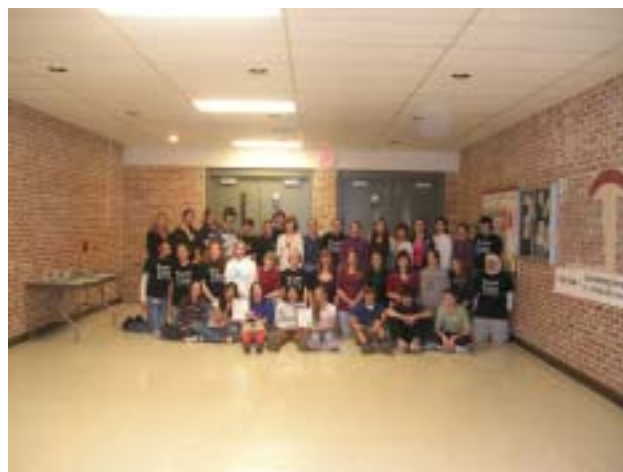
The Bear Team Receive Their UNICEF Award