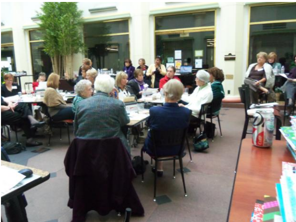
Workshop attendees at their tables