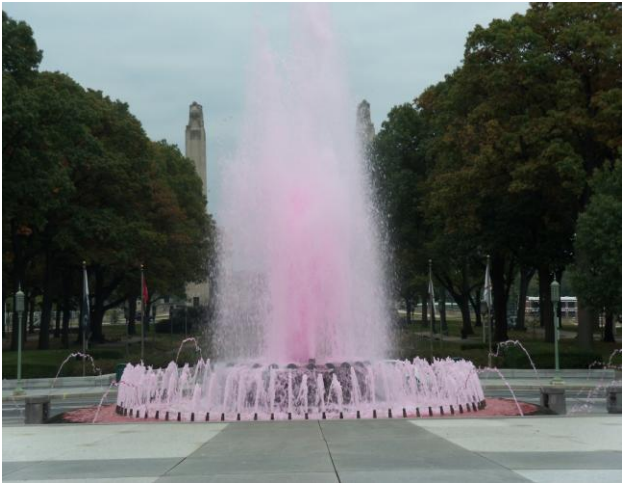
The Fountain was pink for Breast Cancer Awareness