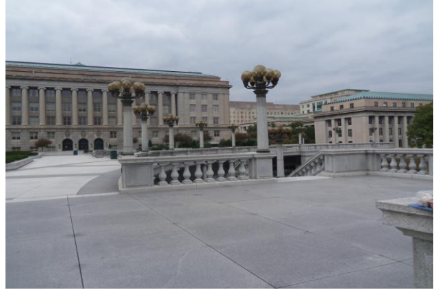
Outside the Capitol