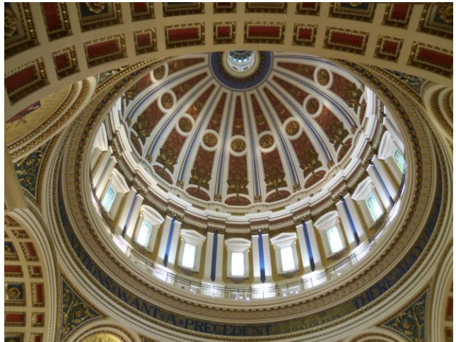
The inside of the dome