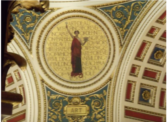
Some of the amazing gold work in the Rotunda